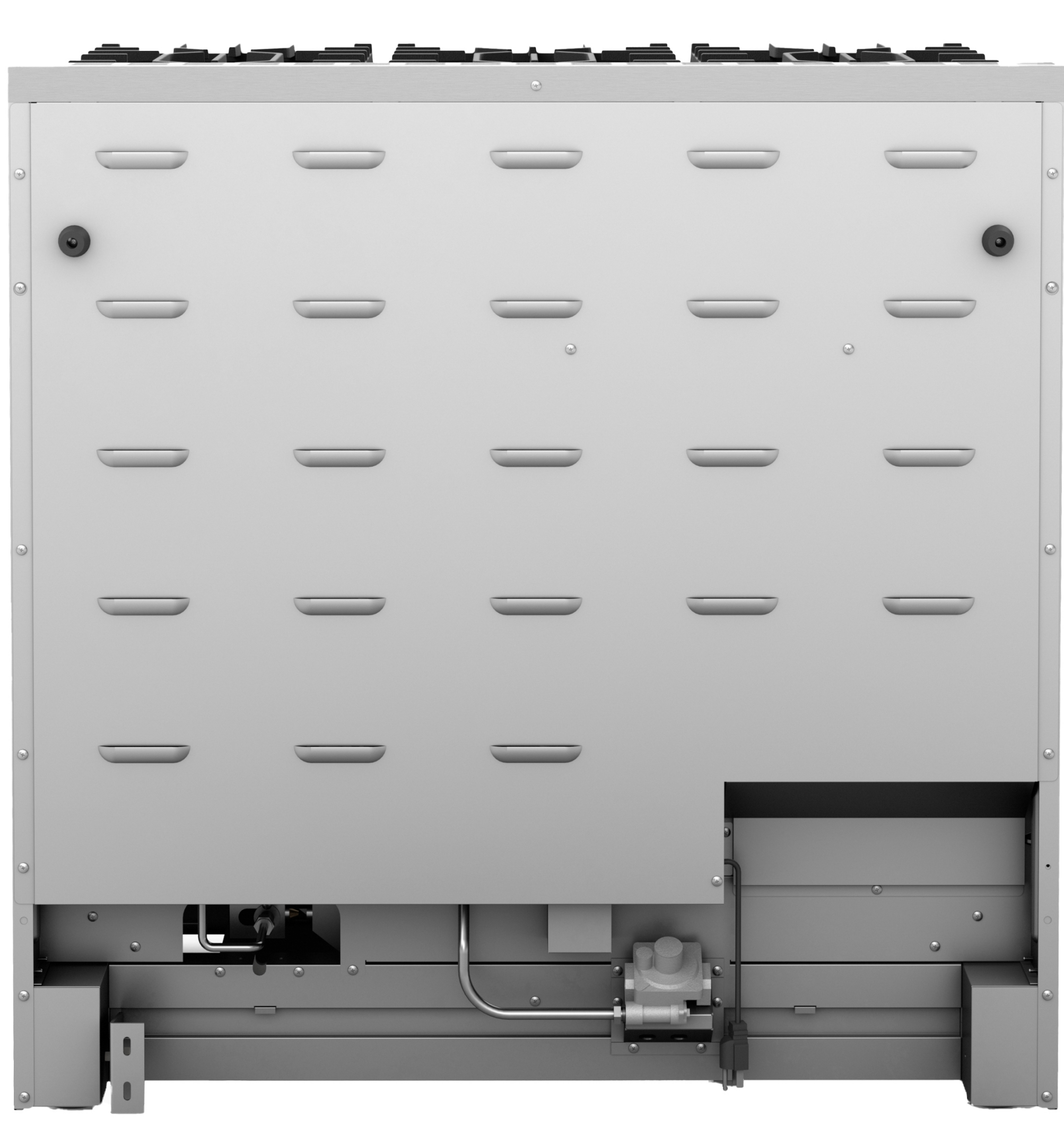
Gas Line Regulator Size: 1/2 in.

LP KIT includes orifices and gas regulator caps