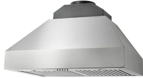
Product: 30 Inch Wall Mount Hood Model Number: TRH30P