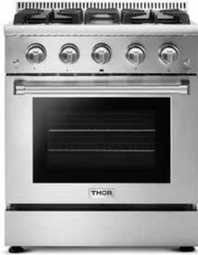
Product: 30 Inch Professional Gas Range in Stainless Steel Model Number: HRG3080U / HRG3080ULP