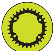
96 BCD CHAINRING UNEVEN BOLT SPACING