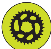
SRAM DIRECT MOUNT CHAINRING