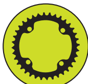
104 BCD CHAINRING EVEN BOLT SPACING

YOUR UPGRADE KIT WILL NOT INCLUDE A 1X FRONT CHAINRING SINCE THERE ARE MANY VARIATIONS. ASK SPEEDLAB OR USE THE CHART BELOW FOR HELP. IN RARE CASES IT MAY BE NECESSARY TO BUY A COMPLETELY NEW CRANKSET.