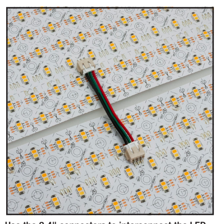
Use the 2.4" connectors to interconnect the LED sheets with each other.