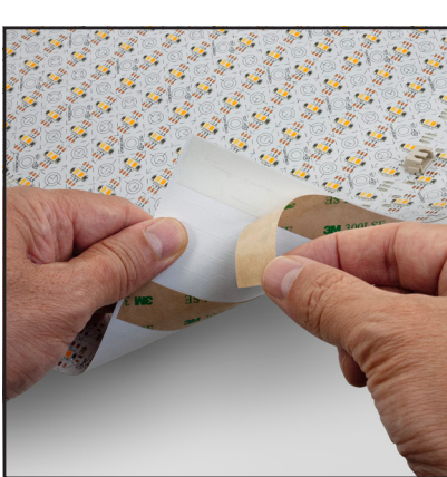
The LED sheet comes with 3M double-sided tape backing, making it easy to apply on flat or curved surfaces such as wood, metal, stone.