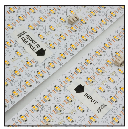
Ensure you check the polarity of the connectors; otherwise, the light will not turn on. Pay attention to the input and output decals on each sheet. These decals must be removed after installation.