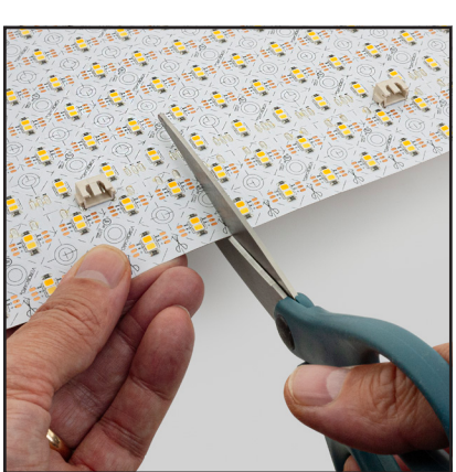
Easily tailor the LED sheet to suit your requirements by cutting it in any direction.