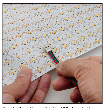
Use the 6" cables to link the LED sheet to the power supply or contoller.