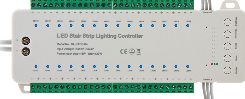
Speed 150ms: 1 red signal light turn on

Speed 1: 150ms 1 red signal light turn on Speed 2: 250ms 2 red signal light turn on Speed 3: 350ms 3 red signal light turn on Speed 4: 450ms 4 red signal light turn on Speed 5: 550ms 5 red signal light turn on Speed 6: 650ms 6 red signal light turn on Speed 7: 750ms 7 red signal light turn on Speed 8: 850ms 8 red signal light turn on Speed 9: 1000ms 9 red signal light turn on Speed 10: 1200ms 10 red signal light turn on