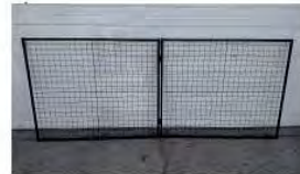
Roof Panel. (Roof panels are smaller Than Side Panels) And Have heavier wire through The middle.