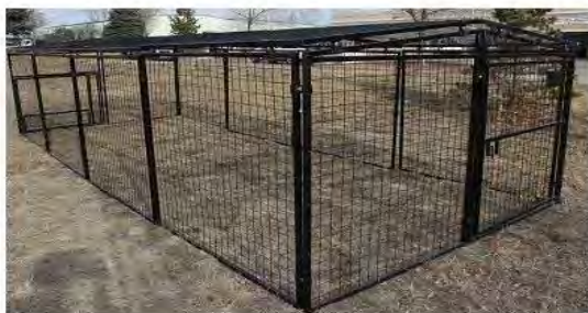
16' Run pictured

Final step: Tighten all nuts and install all clamps.