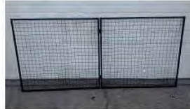
Side Panel. (Side panels are Bigger Than roof Panels)