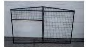
End/Adapter end Panel.