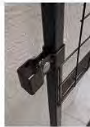
Two piece clamp.