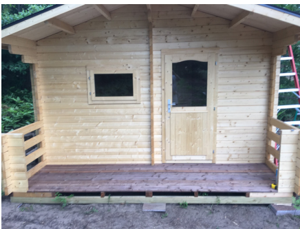
43. View of completed porch.