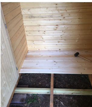
44. Find the changing room floor boards (RB2-1) and nail them in place to the stringers. Use a mallet to tap these tongue and groove boards into place. The final board may have to be ripped on a table saw to provide the correct fit. Trim will be used later to cover the edge, so a small gap is ok. Also, if the floor boards don't reach to the foundation stringers you can create and install a filler piece using purchased lumber.