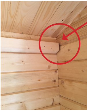
Tapered ceiling support

46. The sauna room and changing roof will have a ceiling below the roof to create an air space. Find four ceiling supports that extend the length of the two rooms and have a taper on them. Nail to the side and center walls in each room, positioning so that the ceiling boards will nail to these as well as the cantilever logs on the inside of the rooms.