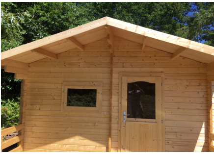
41. View of sauna after fascia boards attached.