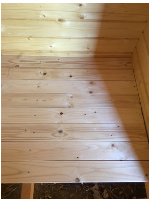
45. Install the floor boards in the sauna room (FB5-1) by nailing to the stringers.