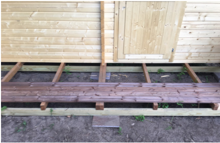
42. Install the porch (terrace) boards (TB1-1) starting at the front and working your way back toward the sauna. Place the narrow porch board (TB1-2) at the front and between the front porch rails. Nail the porch boards to the foundation stringers. NOTE: If the porch boards do not reach far enough to cover the left and right stringers, you can nail a support piece into the stringers and nail into it.