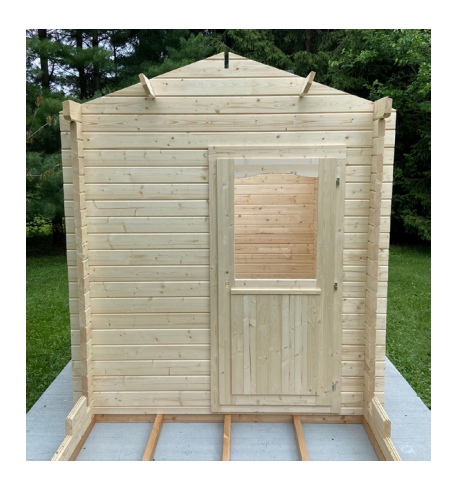
Step 10 Reassemble (W1-1) and (W2-1) as shown and insert top roof truss (PR2) into the notch on front and back of sauna