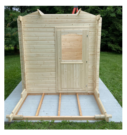
Step 9 Place roof trusses (PR1) as shown and screw into the sloped front and rear portion of (W1-1) and (W2-2).

Place wall sections (W1-1) and (W2-1) on the front and rear walls to begin the slope of the roof. You will need to partially disassemble these as shown in the picture so you can later install the roof sections.