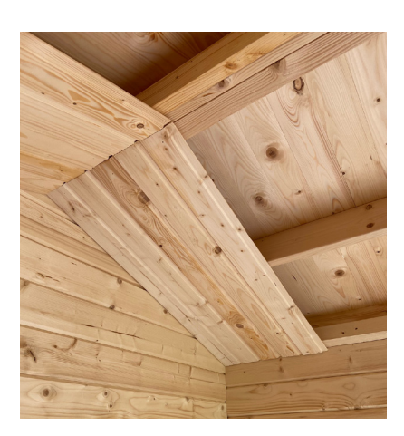
Step 17 Begin installing the ceiling boards (CB1-1) by nailing them to the roof trusses and ceiling support boards installed in step 17. Start by putting the first board tight to the wall with the "groove" side against the wall. This process will go much easier if you use a nail gun and 1-1/2" finish nails. NOTE: As you get to the

other side you may need to rip the last board to make it fit.