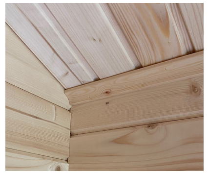
Step 18 You can use the ceiling trim strips (CeS1-1) to trim the ceiling edges to cover any gaps. This is an optional step, and you can use some or all of the trim to cover the gaps where the ceiling meets the wall. If you have no noticeable gaps, it is not necessary to use the trim strips. Also, when installing the trim strips, it is much easier if you use a finish nailer.

other side you may need to rip the last board to make it fit.