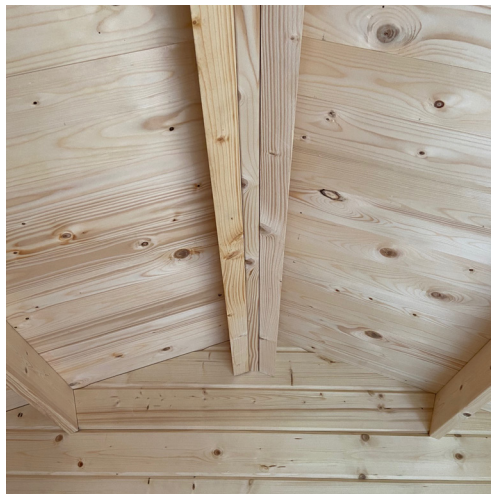
Install 4 ceiling support boards (LT1) on the walls and peak of the sauna room as shown. Be sure that the angled edge faces down and follows the pitch of the roof. The angled edge of the support board must align with the underside of the roof truss. This allows the later ceiling boards to be firmly attached at both ends.