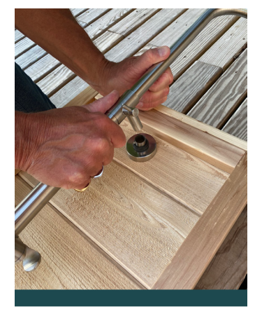
4. Slip the mounting post into the wall bracket.

3. Hand tighten the shower stem onto the valve assembly (hand tighten only).