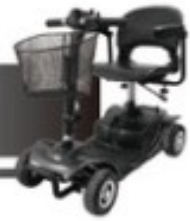
Table 1 SPECIFICATIONS