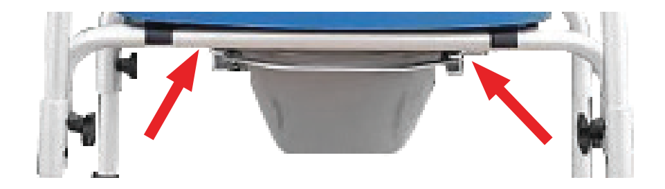
<u>Step 3</u> Slide Commode Bucket into guiderails located under the seat.

Attach the legs to the frame by depressing push buttons into the tubes located on each side of the legs. Make sure that push buttons "snap" correctly through holes and are stable and adjusted to the same height.