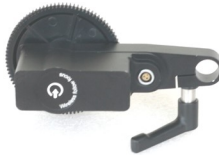
Proaim Motor Unit