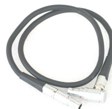
Lemo Cable (60cm)