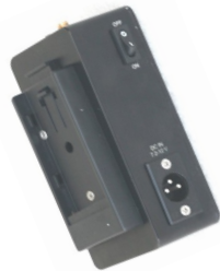
Proaim Receiver Unit