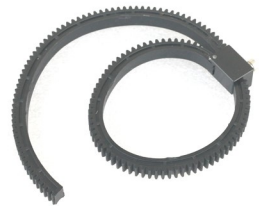
Proaim Marking Rings (1 Included)