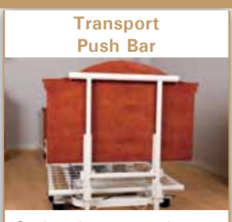
Optional transport bar aids in moving the bed without compromising caregiver safety.