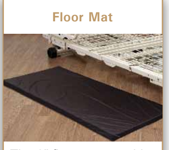
The 2" floor mat provides extra security against injury for residents who are prone to falling out of bed.