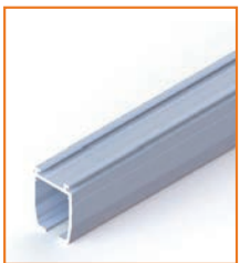
Regular Track Standard rail for most applications.