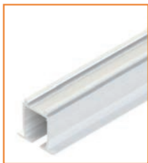
Flush Mount Track For the lowest-profile installation.