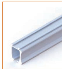
Super Track Heavier rail for longer free spans between attachment points.