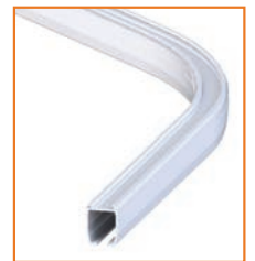
Curved Track With three angle options (22, 45 and 90 degrees), provides endless room layout options and is available in both standard and flush mount.