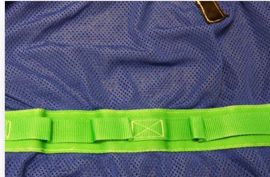
Back strap with Permanent Crease