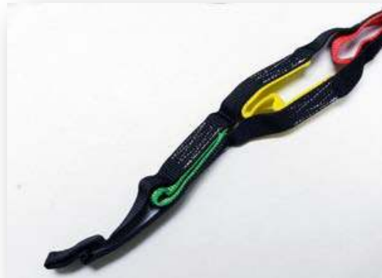
Permanent Creasing of Loop Strap