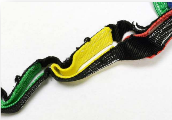
Loop Strap with Excessive Edge Abrasion

Strap Brittleness / Stiffness / Surface and Edge Abrasion are additional indicators that the sling may have been laundered in unsuitable conditions and has loss tensile strength. Loop straps that have stiffened or become brittle will tend remain in the state, position, or shape it is bent into instead of returning into a normal relaxed state.