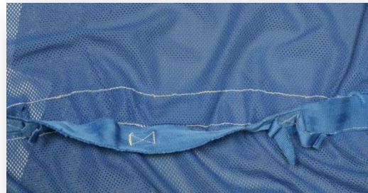
Back/Handle Strap Decomposition