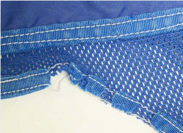
Edge Binding Decomposition

Decomposition of Edge Binding and other components of the sling are clear indicators of degradation from chemical treatment. Color loss and a chalky appearance is common. Stitching (comprised of a different material) may still be intact.