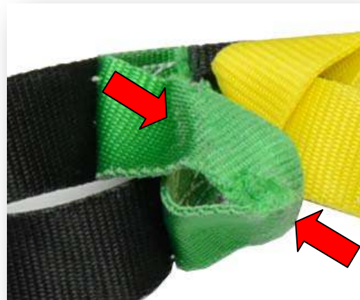
Color Loss and Chalky Appearance