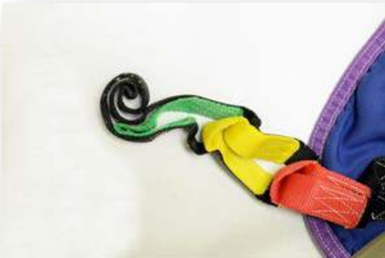
Extreme Loop Strap Curling

Extreme Curling / Permanent Wrinkles of loop straps can set in when the slings are dried at high heat or dried over an extended period of time. Heat combined with bleach or other chemicals will intensify the chemical action.