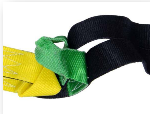
Stiffened and Brittle Loop Strap

Permanent crease, wrinkles along with brittleness increase chance that the fabric will suffer more damage from abrasion, internal fiber abrasion as well as external abrasion with other objects. Wash cycles with excessive agitation will increase abrasion and degradation of the fabric.