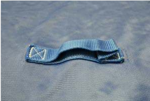
Handle with Permanent Crease

In addition to the loop straps, the back strap and sling handles if present will also show the permanent creases. Permanent creases will tend towards its original wrinkled position even when stretched out.