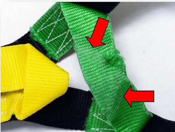
Surface Abrasion at Creases

Surface Abrasion / Color Loss especially at creases or areas frequent use. Stiffened or brittle fabric will usually wear excessively around the creases and areas that come into frequent contact with other object. The surface and edge abrasion is a result of this and will usually be accompanied by loss of color with a chalky appearance