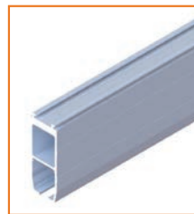
TrackPlus Our highest rigidity track for our longest free spans.