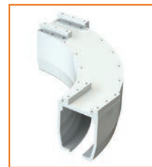
Quick Curve The smallest curve in the market only offered by Handicare to address tight corners and obstacle avoidance with a 6.5 in (165 mm) radius.