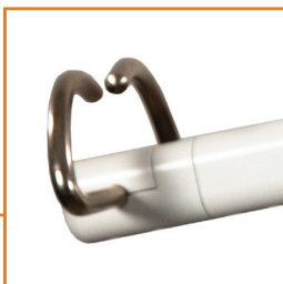
Bull Horn Connector