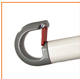
Spring Latch Connector