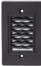
DVW Vertical Wave