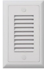
SVL Vertical Louver