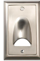
SVS Vertical Scoop