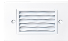
DHW Horizontal Wave