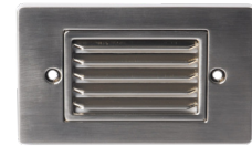
DHL Horizontal Louver