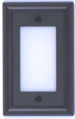
SSM Smooth Lens