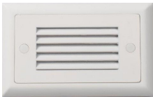
SHL Horizontal Louver