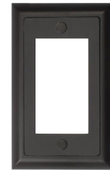
FPF Faceplate Frame