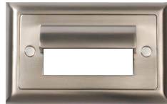
SHS Horizontal Scoop