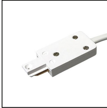
SKU: EL-Q10-PF LED Mini Track Power Feed - 12-24V DC - 39 in. Cord