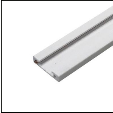
SKU: EL-Q10-TRK 39.5 in. Long LED Mini Track - 12-24V DC