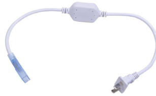
POWER CORD SET EL-FLE-PC Power Cord EL-FLE-EC End Caps EL-FLE-PIN Male Pins