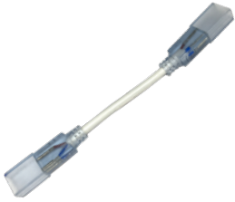
120V LED TAPE JUMPER EL-FLE-J-6 (6 INCHES)