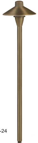
EL-CL-649B-AB-24 24" Stem shown