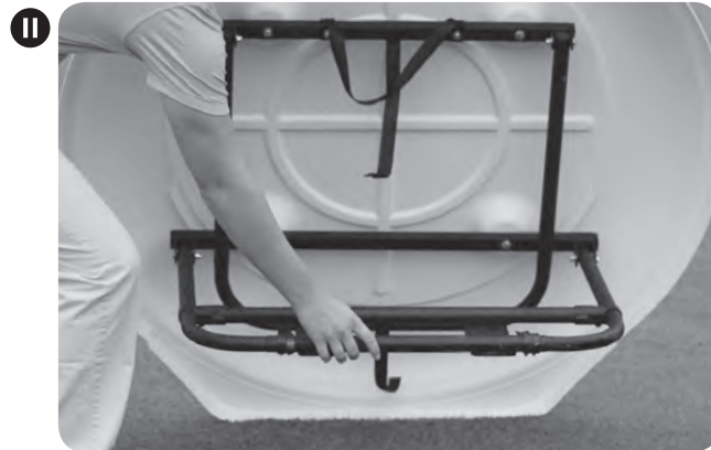
II Lower bottom leg of stand