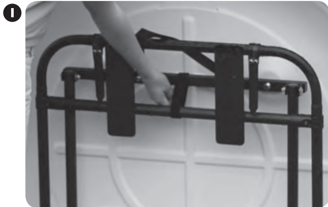
I Unfasten velcro strap