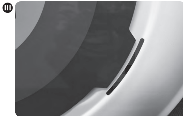
III To replace, insert one bottom tab