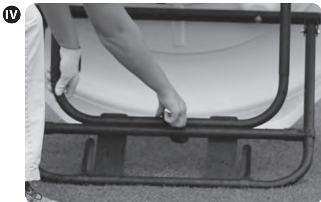
IV Secure with velcro strap