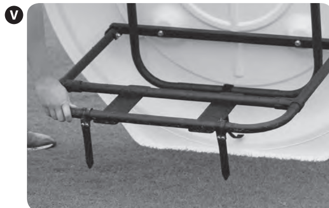
V Anchor ground stakes, if needed, for additional stability

Keep The Golf Target upright or lay flat when not in use – to maintain optimal shape.