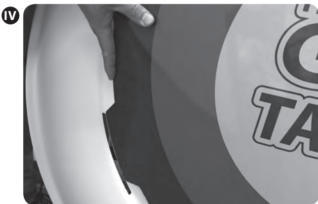
IV Bend Graphics Panel to insert other bottom tab