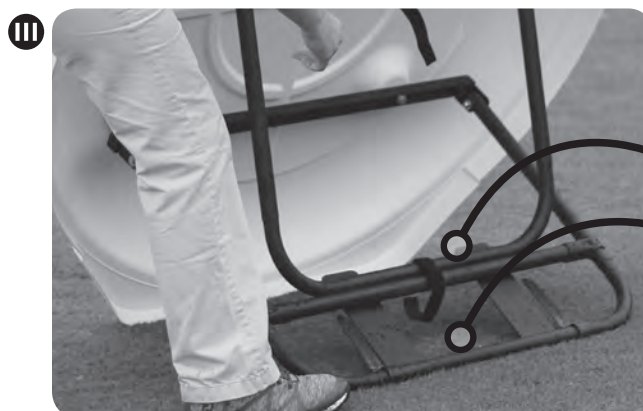
III Place upper leg of stand into desired height setting