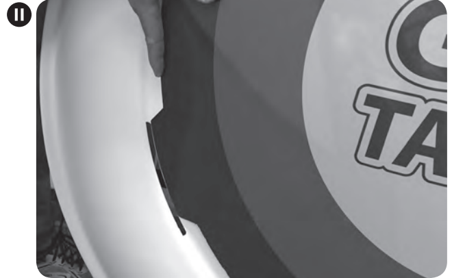
II Repeat for the bottom tabs