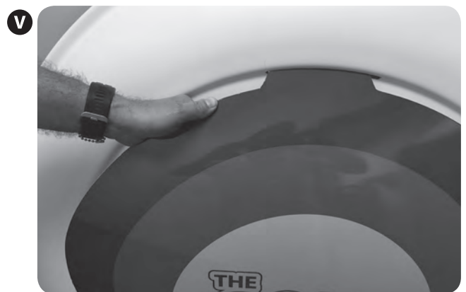
V Finally, bend to insert the top tab