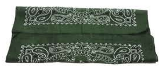
Fold the bottom to the center.