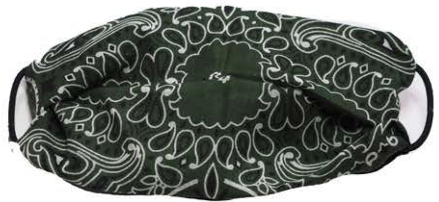
Flip over to wear.