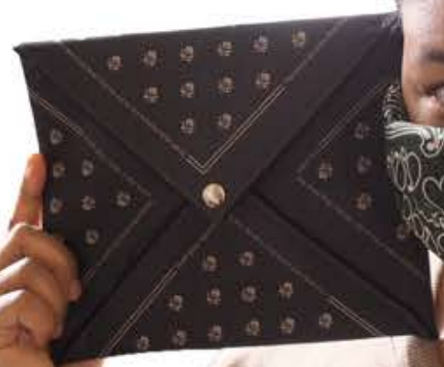
Match with your clutch!