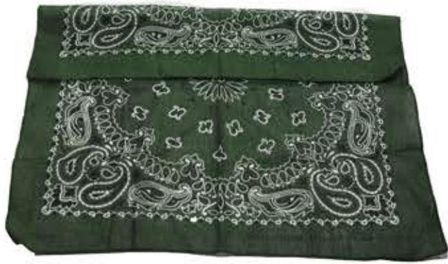
Fold the top to the center.