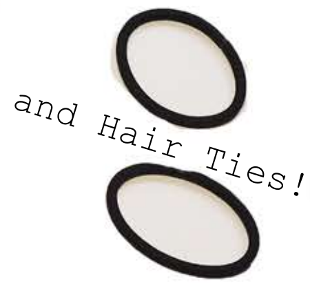
and Hair Ties!