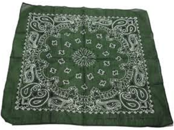
Take one 18"x18" prewashed cotton bandana and place it face down.