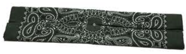
Fold the bottom to the center.