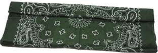
Fold the top to the center.