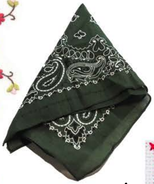
Using a Bandana...