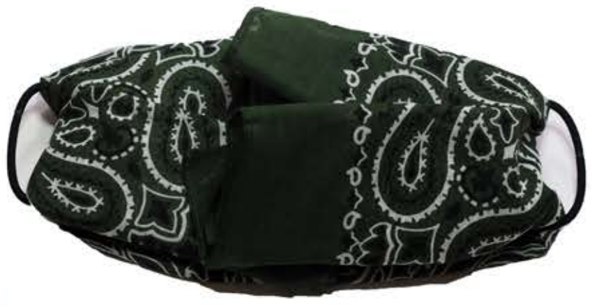
Fold in the sides.