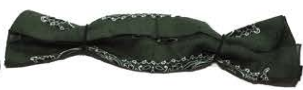
Thread the ends of the bandana through the hair ties.