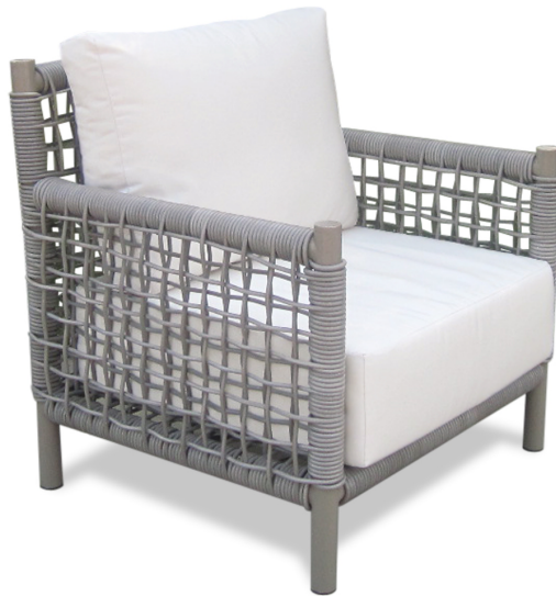
Shown in Taupe Wicker and Natural Fabric (Pieces may be available in different finishes. Please refer to the Materials section)