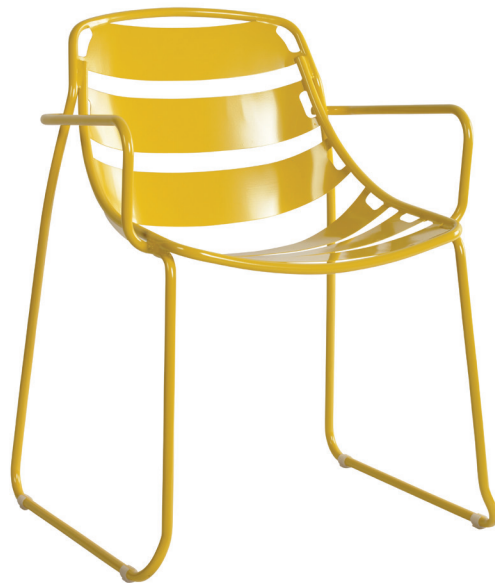
Shown in Citrine Yellow Powder Coated Steel (Pieces may be available in different finishes. Please refer to the Materials section)