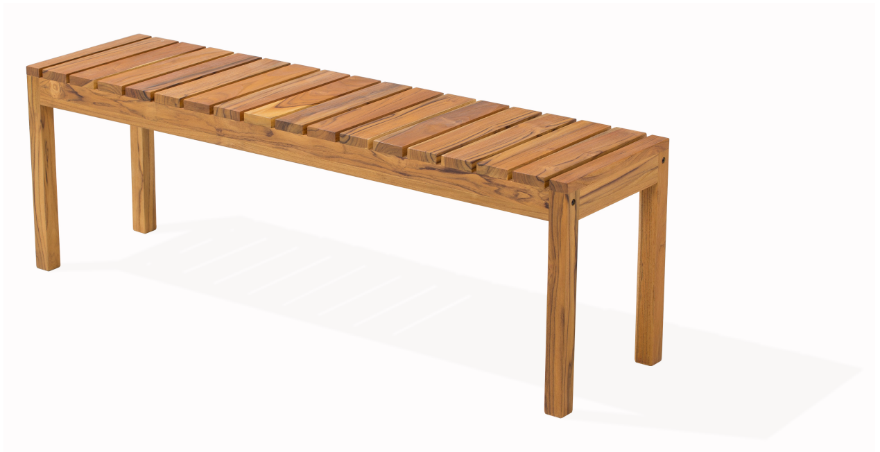
Shown in Natural Teak Wood (This collection is only available in Natural Teak Wood)