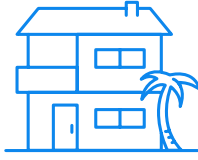
Hospitality and Airbnb