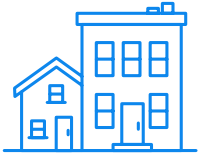
Multi-Family and MDU