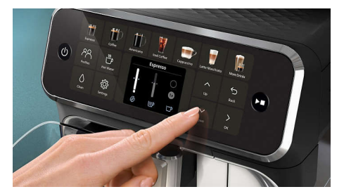
Our easy-to-use, intuitive display is your place to select a recipe, and adjust the strength, coffee length and milk volume. Want to save your preferences? Save your drink in one of two user profiles.