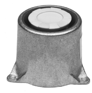
FAA - PMA APPROVED

Installation Guide: Ground Crew Call Horn P/N 01-0770544-00