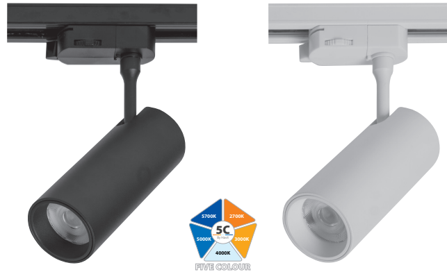
Black Single Circuit Track

HCP-102110 1M | HCP-102120 2M | HCP-102130 3M