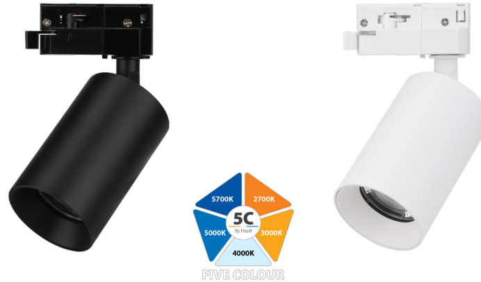
Black Single Circuit Track