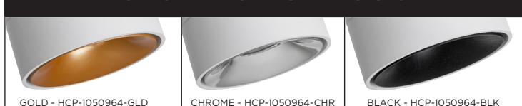
GOLD - HCP-1050964-GLD