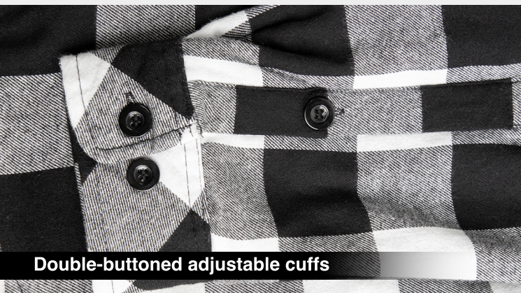
Double-buttoned adjustable cuffs