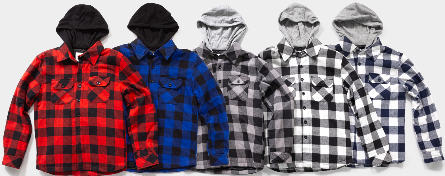
RED / BLACK