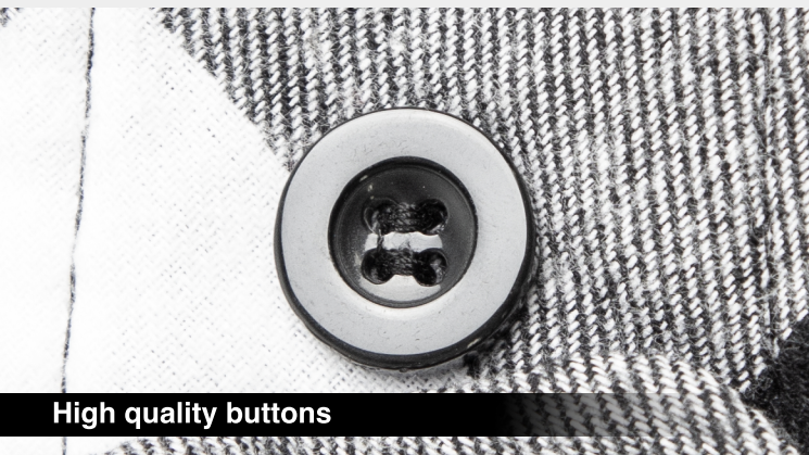
High quality buttons