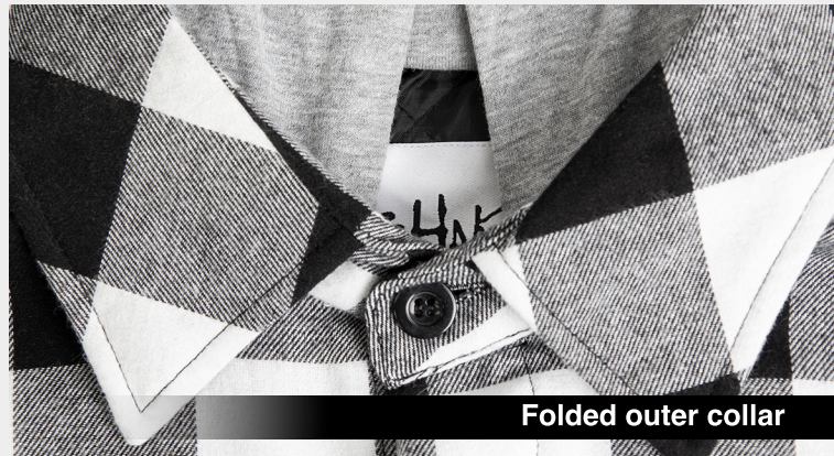
Folded outer collar