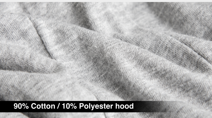
90% Cotton / 10% Polyester hood