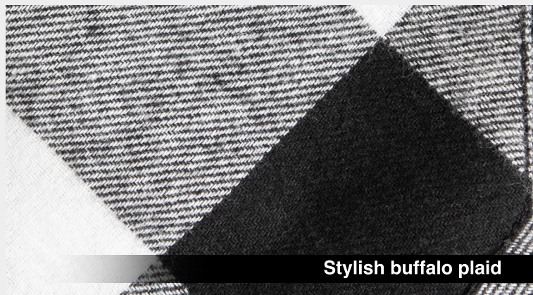
Stylish buffalo plaid