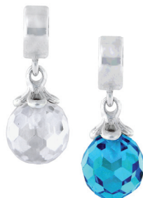
Combine with a beautiful CHARM...