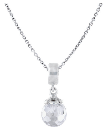
...to create your own NECKLACE