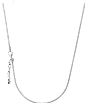
Choose your favourite CHAIN