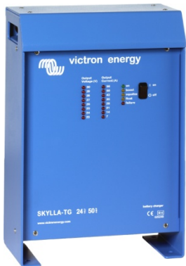
Skylla Charger 24 V 50 A