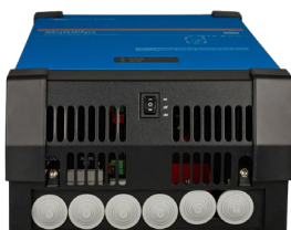
MultiPlus 2000 VA (with bottom cover)