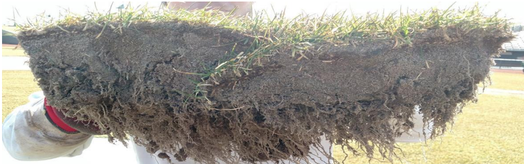
Photo taken in March after a newly sodded field was treated with Gravity SL PGS the previous Fall.