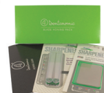
Item # 54592