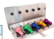
Item # 54544