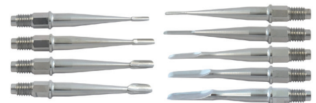
Item # 54547