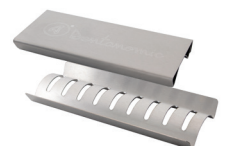
Item # 54575