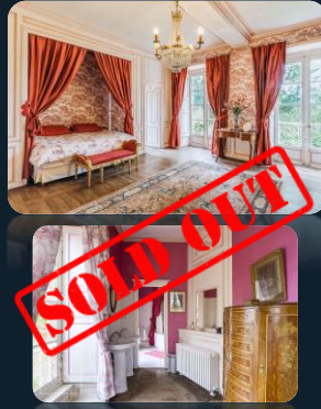
RED SUITE £2,600

One of the best bedrooms in the Château. 29m2 bedroom with 13m2 ensuite bathroom, with double walk-in shower (shared with antichambre). Overlooks the Japanese garden.