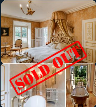
THE GOLD SUITE £2,100

One of the best bedrooms in the Château. 26m2 bedroom with a 18m2 private balcony. 2mx2m bed, fully renovated bathroom with a bathtub and a large walk-in shower. Louis XIII bedroom shares the bathroom with this room, Jack and Jill equal access.