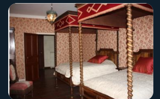
LOUIS XIII £2,000

Located on the first floor. 21 m2 with 2 single Louis XIII original carved poster beds. Dark, moody room with an authentic feel. Louis XIII bedroom shares the bathroom with the Gold Suite, Jack and Jill equal access.