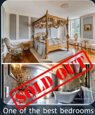
THE BLUE SUITE £2,600

One of the best bedrooms in the Château. 29m2 bedroom with 13m2 ensuite bathroom. Has a stunning gilded four-poster bed 1.6x2m, fully renovated bathroom with a bathtub and a large walk-in shower.