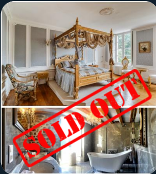
THE BLUE SUITE £2,100

One of the best bedrooms in the Château. 29m2 bedroom with 13m2 Ensuite bathroom. Has a stunning gilded four-poster bed 1.6x2m, fully renovated bathroom with a bathtub and a large walk-in shower.