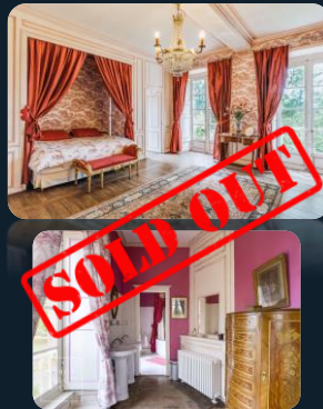
RED SUITE £2,100

One of the best bedrooms in the Château. 29m2 bedroom with 13m2 ensuite bathroom, with double walk-in shower (shared with antichambre). Overlooks the Japanese garden.