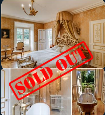
THE GOLD SUITE £2,600

One of the best bedrooms in the Château. 26m2 bedroom with a 18m2 private balcony. 2mx2m bed, fully renovated bathroom with a bathtub and a large walk-in shower. Louis XIII bedroom shares the bathroom with this room, Jack and Jill equal access.