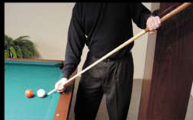
With regular short cues, a shot like this can be quite the challenge.

Why let a little post get in the way of owning the pool table that you've always wanted?!