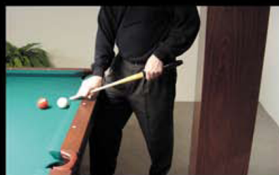
With Trouble Shooter™, even the tightest shot can be possible.

Trouble Shooter™ cues allow you to play a great, comfortable game of pool without the inconvenience of room size restrictions or obstacles.