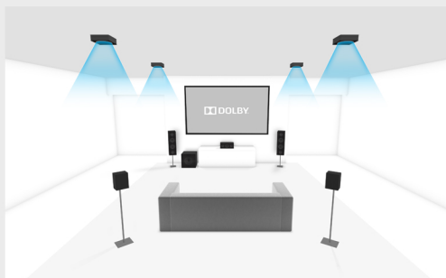
Perspective detail for 5.1.4 setup

This refers to how many overhead or Dolby Atmos enabled speakers you can use in your Dolby Atmos capable setup.