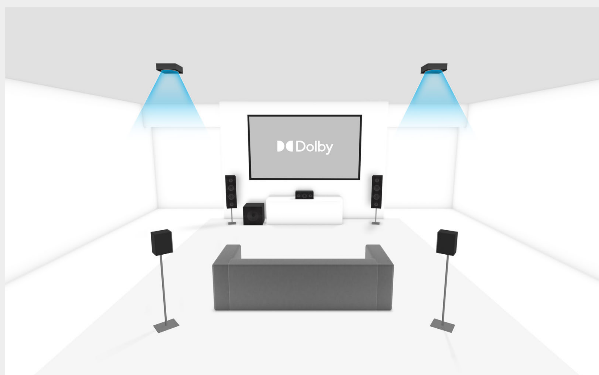
PERSPECTIVE DETAIL FOR 5.1.2 SETUP

This refers to how many overhead or Dolby Atmos enabled speakers you can use in your Dolby Atmos capable setup.