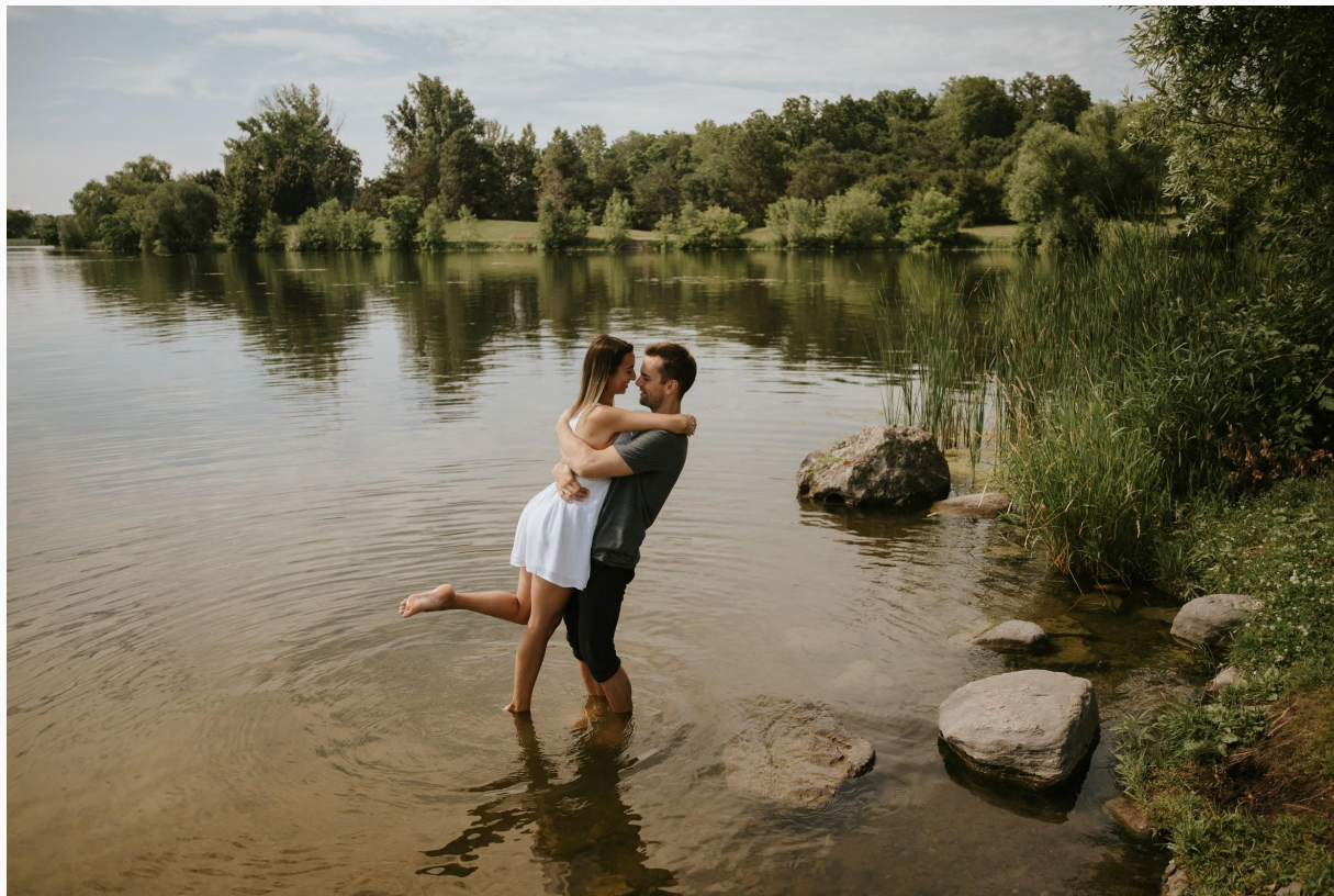
Engagement pictures, Ottawa, Canada.