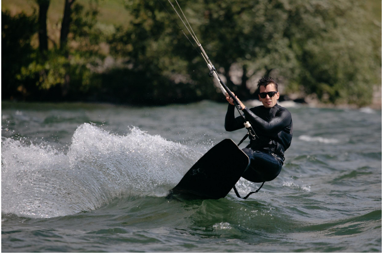
In front of the camera for a Seafarer sporting goods product photo shoot.