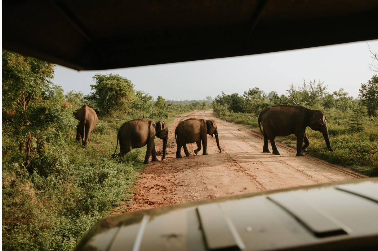
A herd of wild elephants, Udawalawe, Sri Lanka.