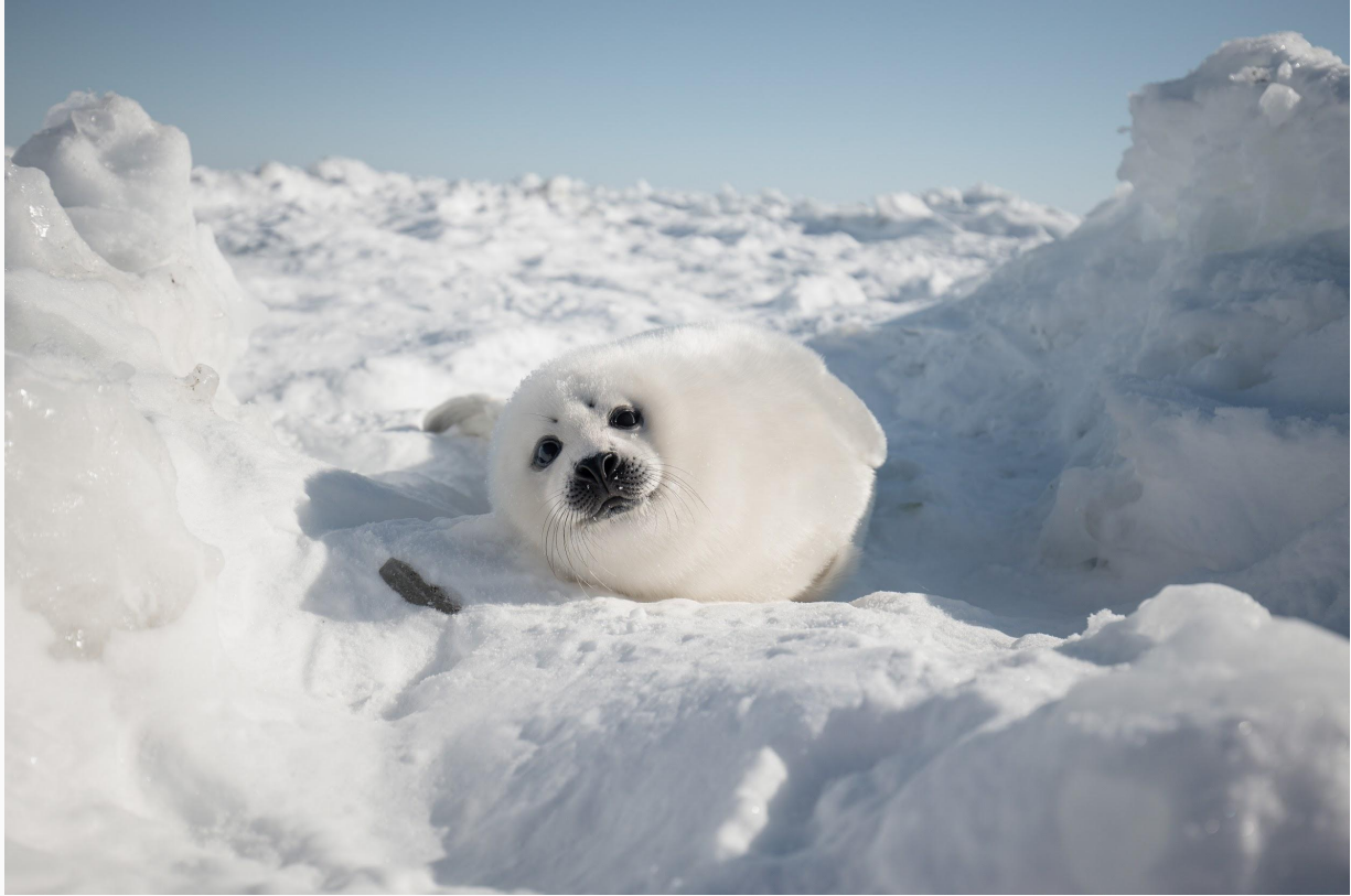
Facing climate change, a harp seal pup in the sun on the ice sheet. Magdalen Islands, Canada.