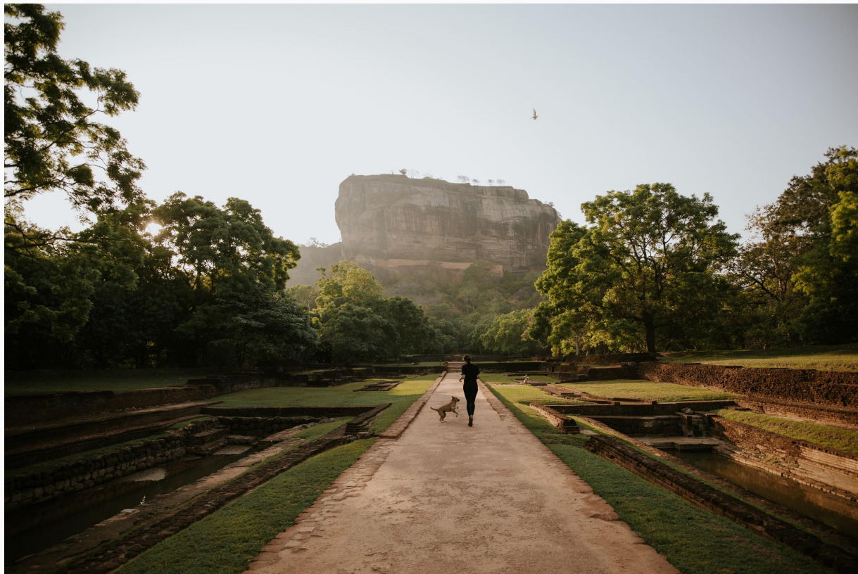
Sunrise in the Sigiriya gardens, Central Province, Sri Lanka.