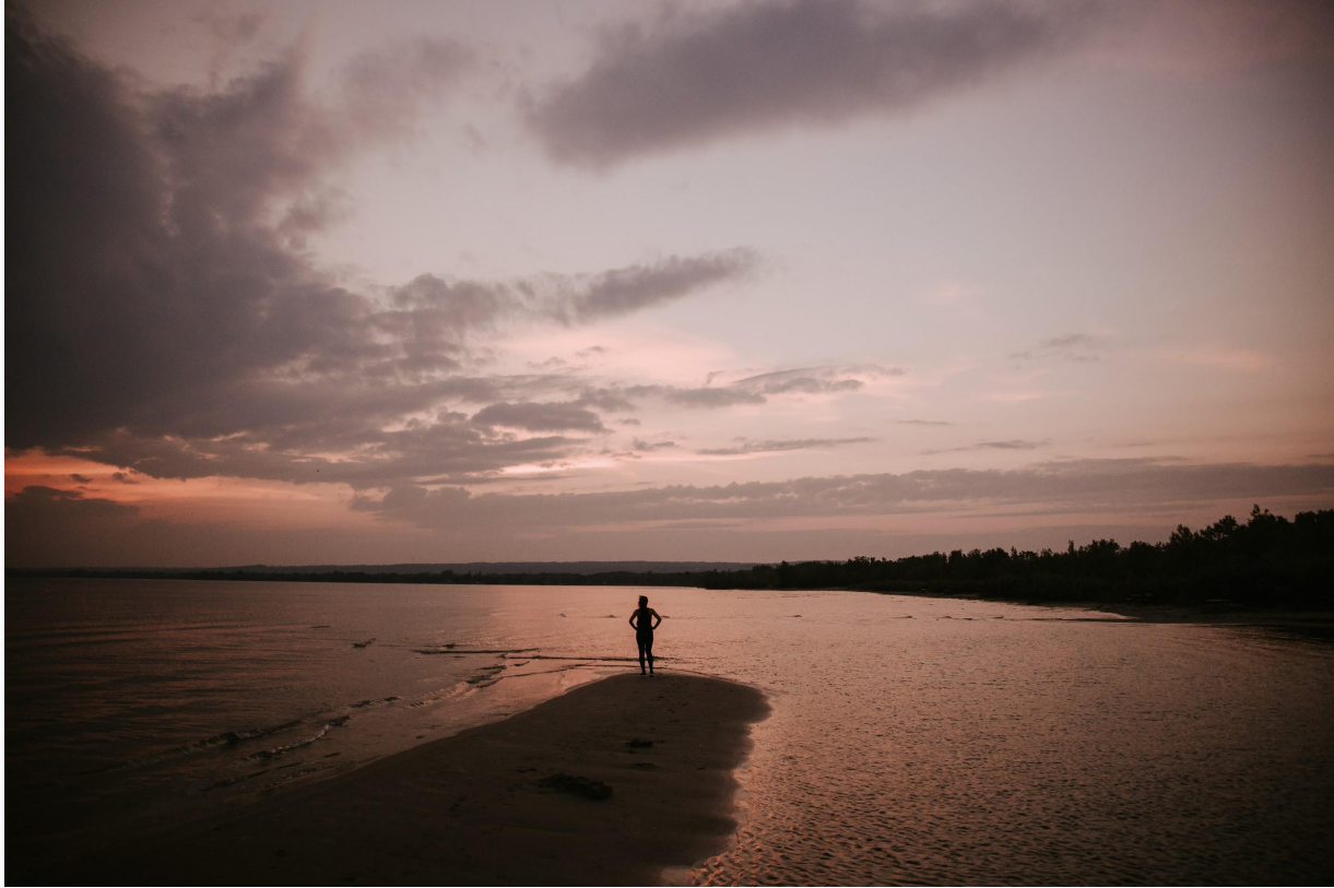
Enjoying the sunset at Sandbanks Park, Canada.