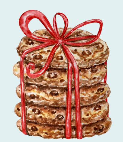
Deliver Xmas Cookies to the neighbours