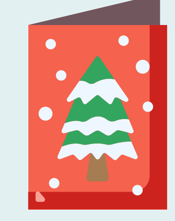
Write Xmas Cards for friends