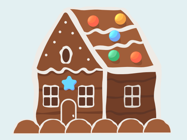
Make a gingerbread house

Sort through your toys and donate some to charity