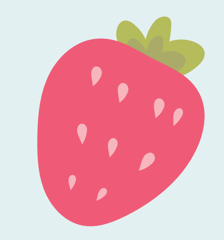
Go strawberry picking