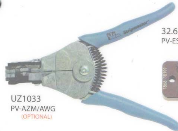
UZ1033 PV-AZM/AWG (OPTIONAL)