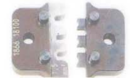
32.6021-..... PV-ES-CZM-..... (OPTIONAL)