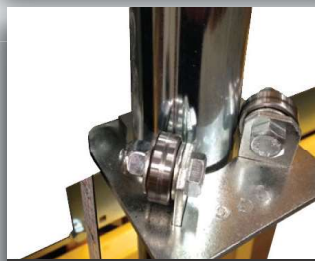
Sealed Steel Roller Bearings