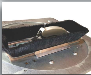
Dust Containment Brush