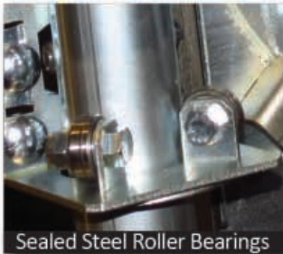
Sealed Steel Roller Bearings