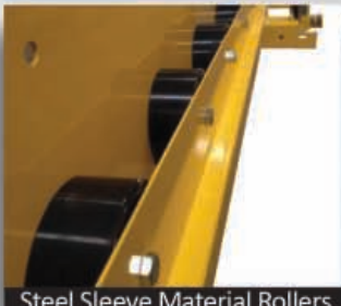
Steel Sleeve Material Rollers