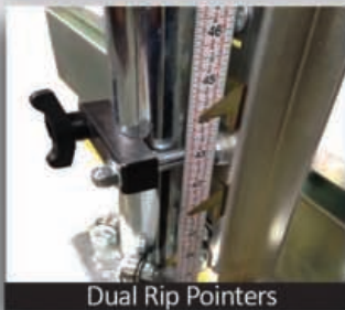
Dual Rip Pointers