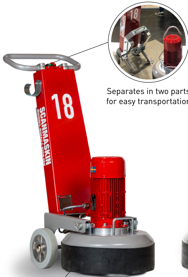
Separates in two parts for easy transportation