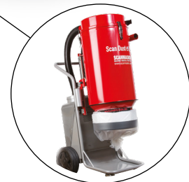
Recommended vacuum SD 2900