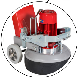
Weight package available 22,5 kg / 49 lbs